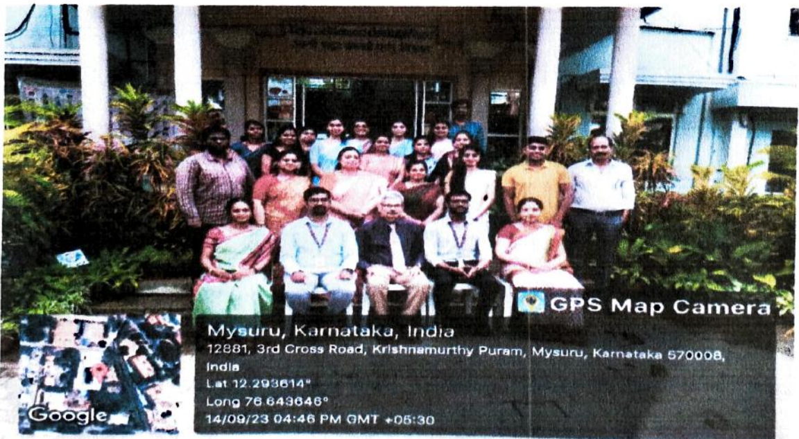
Group photo of faculty members with Principal, ICT Relationship Manager, ICT academy Trainer, IQAC Coordinator & ICT Committee Coordinator